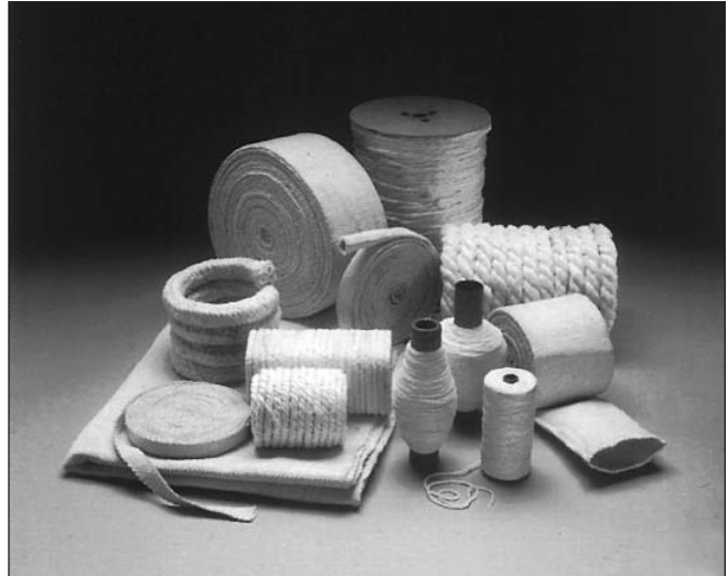
Fiberfrax Woven Textiles Product Family

For additional details on the available woven textile product forms, typical properties and applications for which they are appropriate, refer to Fiberfrax Woven Textiles, Product Information Sheet, Form C-1425.