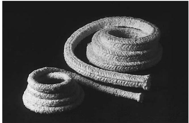
Fiberfrax Round and Square Braid

Fiberfrax wicking is a high temperature twisted roving made from Fiberfrax ceramic fibers and organic carrier fibers. It possesses the same thermal and chemical properties common to all Fiberfrax forms. It is typically used in