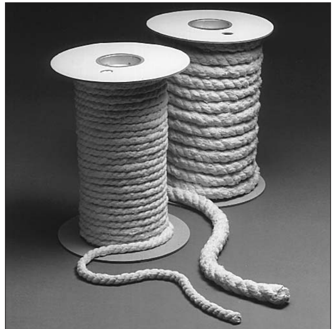
Fiberfrax Rope and HD Rope

Refer to the product Material Safety Data Sheet (MSDS) for recommended work practices and other product safety information.